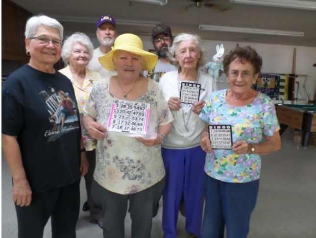
June 14 Bingo