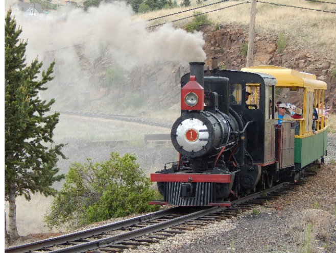
June 21 CC&V Train ride