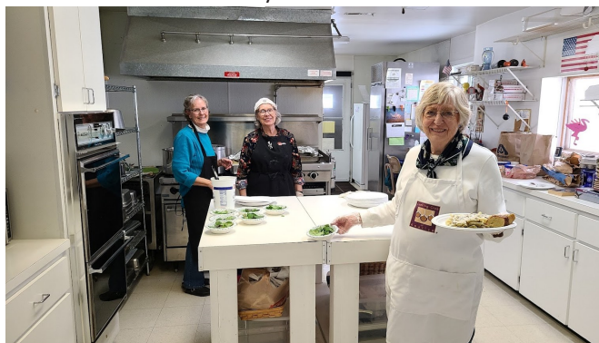
January 25 Catered Meal