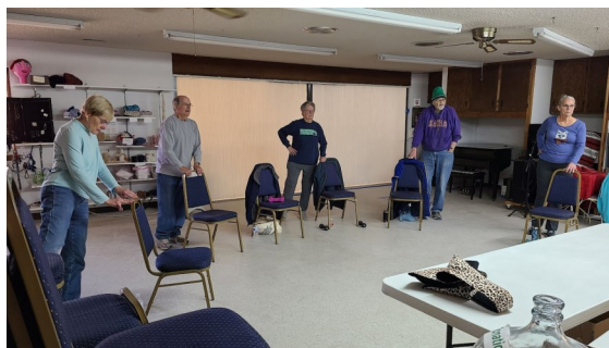
January 11 Exercise Class