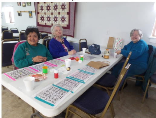
January 29 folks not spooked by the weather All were winners!