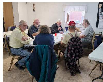
January 25 Liar's Table Guys