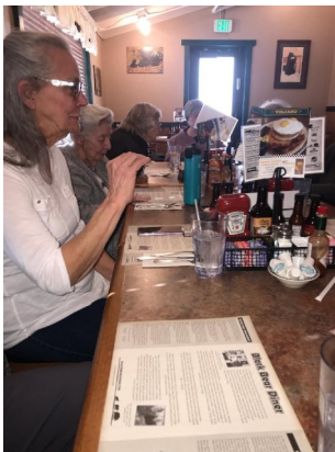
February 10 - Lunch before Air Force Planetarium Show