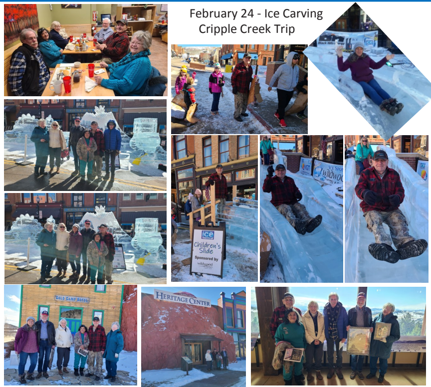
February 24 - Ice Carving Cripple Creek Trip