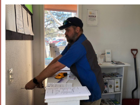
New door opener being installed