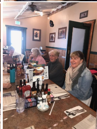
February 14 Valentines Day Potluck