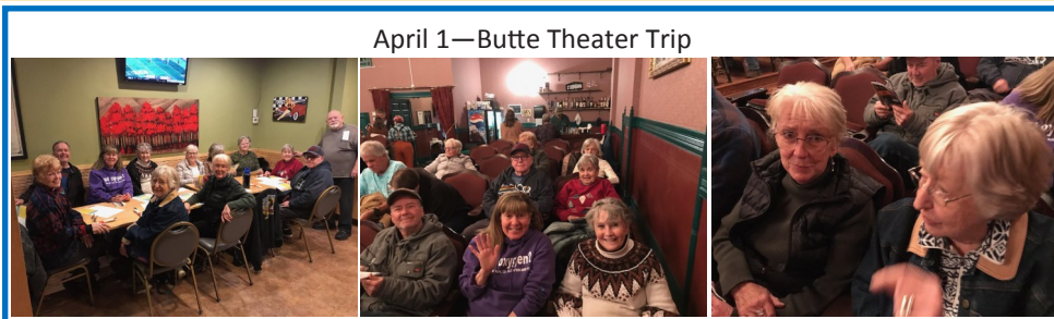
April 1—Butte Theater Trip