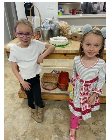
4H girls baked a cake for us