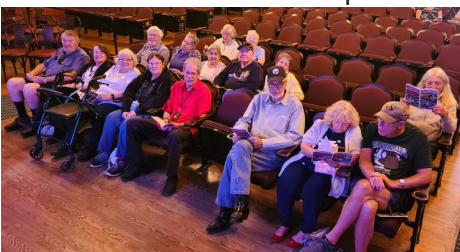
Butte Theater Trip