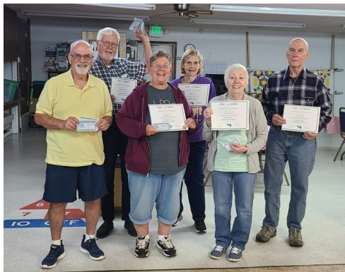
July 1 Aging Mastery Graduates