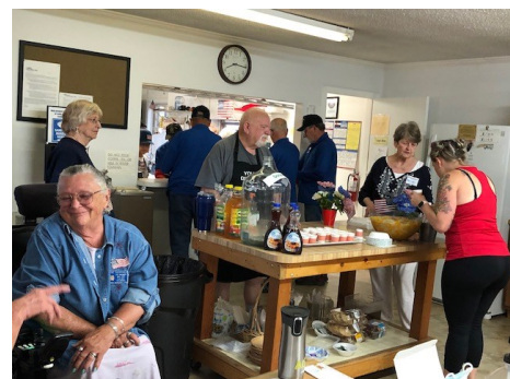
July 4 Pancake Breakfast