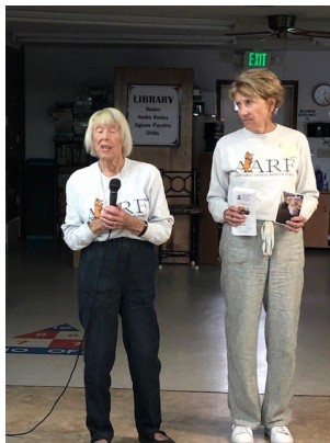
AARF ladies presenting about fostering or adopting homeless animals