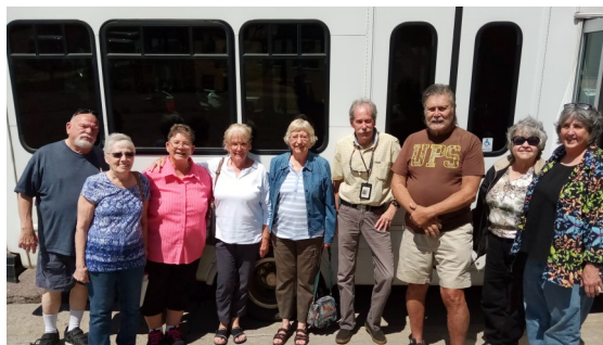
August 4 - Butte Theater trip