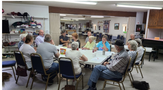
Financial Planning Seminar