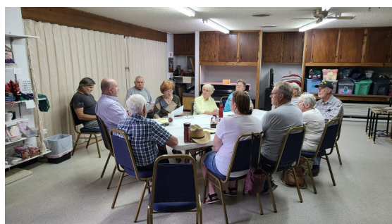
August 26 - Recycled Paper Frames Workshop