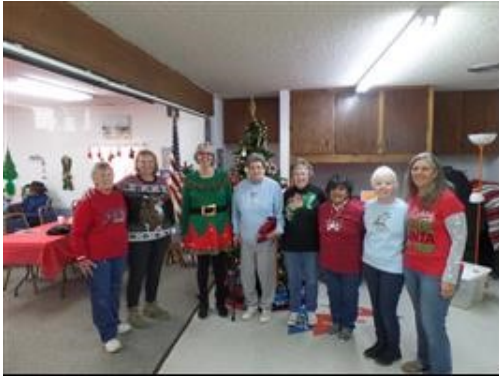
Ugly Sweater day!