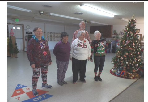
December 16 Ugly Sweater Contestants