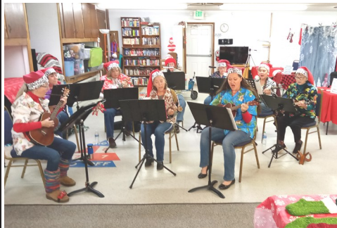
GadeUKES Ukulele Ensemble