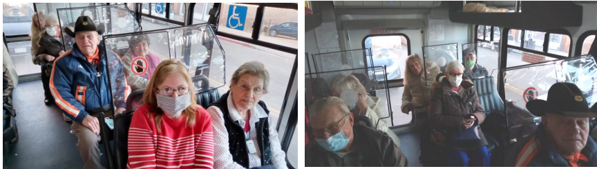
December 14 Park State Bank Catered Meal