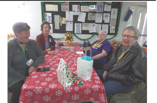
December 16 Daybreak Visitors