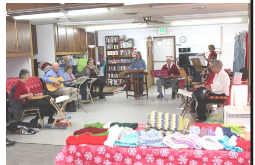
Strings & Things Dulcimer Ensemble