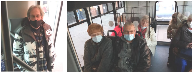
December 11 Cripple Creek Lunch & Butte Theater