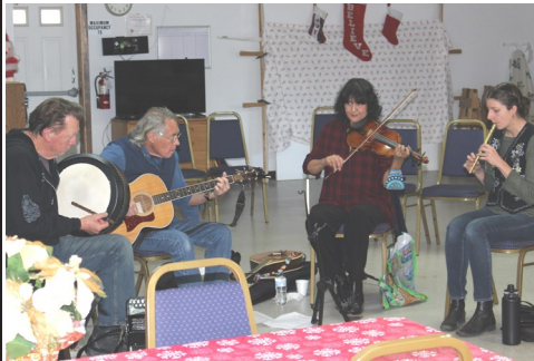
Celtic Jam Session