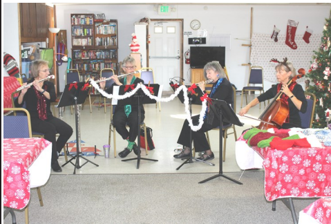
Cinnamon Tea - Flute Ensemble