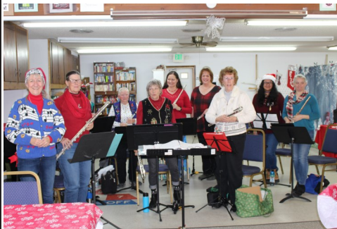
High AltiTooters Flute Ensemble