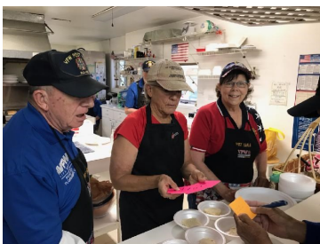
Auto Show Pancake Breakfast Kitchen Crew