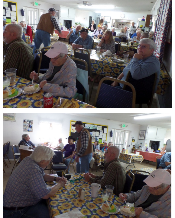
Catered Meal with Forest Ridge