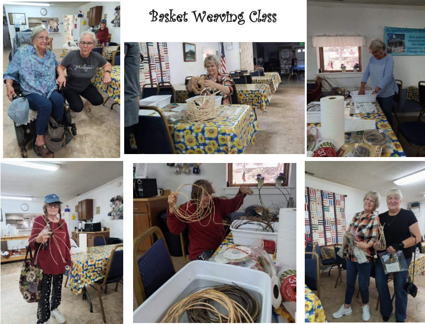
Basket Weaving Class