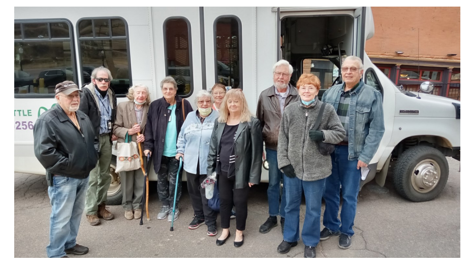
Oct 21 Cripple Creek Lunch & Butte Theater Trip