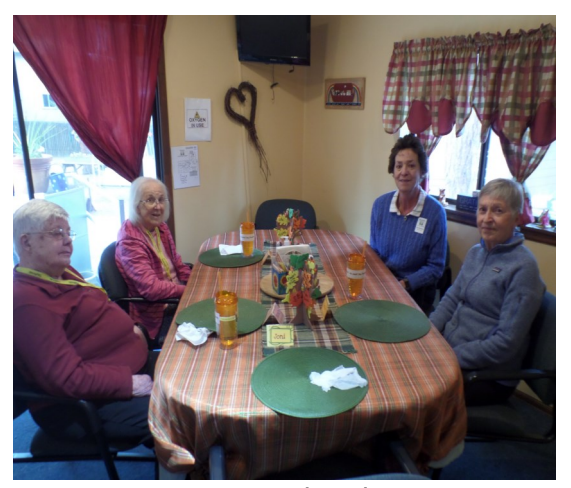
Our Daybreak Zoom Bingo Buddies