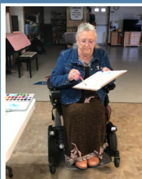
October 24 Watercolor Class