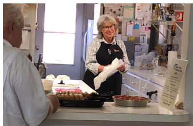
October 13 Potluck