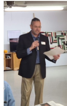
WP Library Information Program