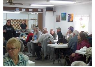
November 9—Veteran's Day Chili Lunch