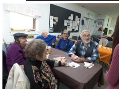
November 21—Holiday Shoppers at Willowstone