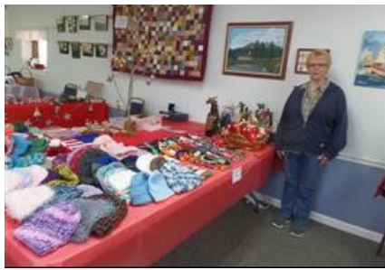
November 16—Holiday Bazaar