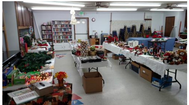
Successful Holiday Bazaar!