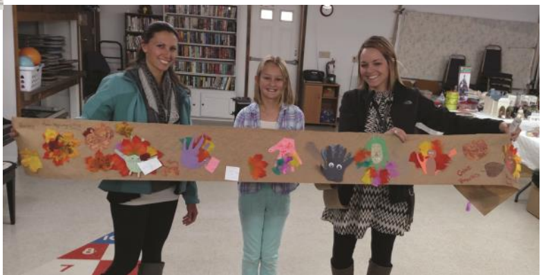
Table runners for the Senior Center from Woodland Park Middle School Kiwanis Builders Club.