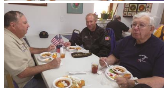
VFW Post 11411 Free Chili Lunch ↑ Cripple Creep-show ←