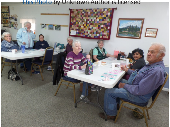
November 5 in house Bingo players enjoy being together along with at-home ZOOM players