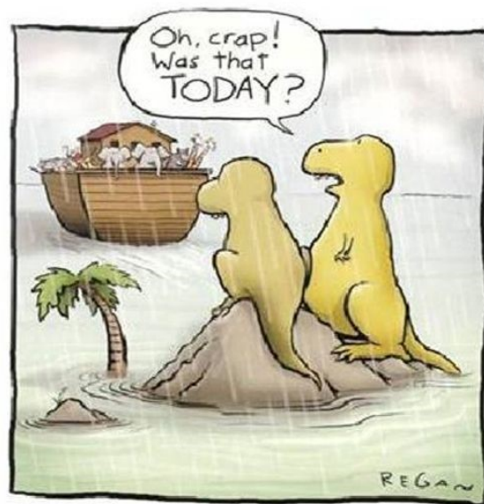
The first senior moment.

The health and well being of all is our overall goal!