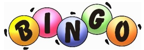
This Photo by Unknown Author is licensed