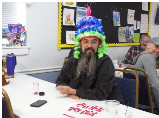
JD wearing the Dunce's hat !!!