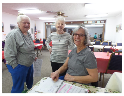
Lunch Check in Ladies