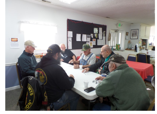
The Morning Domino Guys