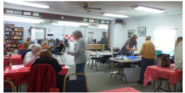
Pebble Art Craft Day