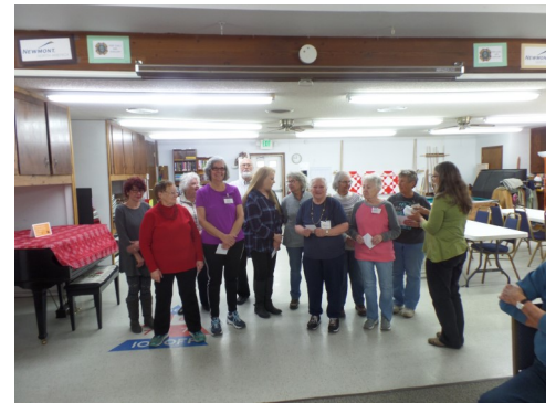
2018 Volunteers with 300+ hours!