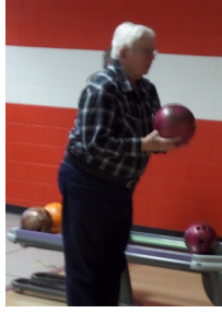
February 7 - Bowling