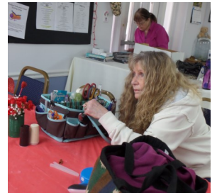
Stamping Card Making Craft Day