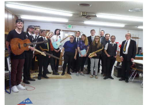
Pikes Peak Community College Jazz Ensemble provided the entertainment