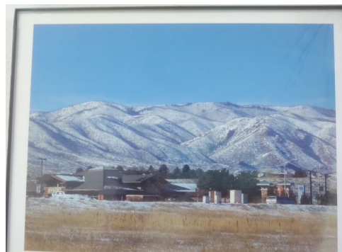
2nd Place - Jeanette Zupancic