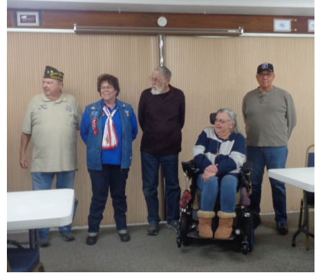
VFW presenting $1000 Donation to the Senior Center