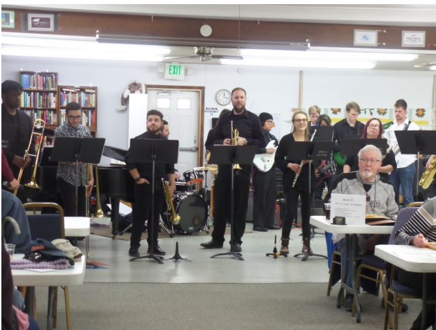
PPCC Jazz Band provided fabulous Music