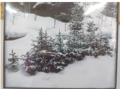
1st Place - Wally Banzhaf