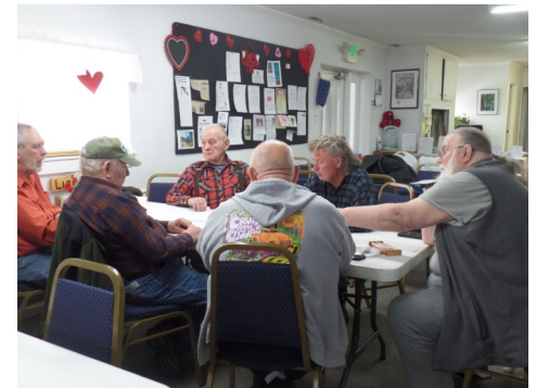
Early Morning Guys at the liars Table