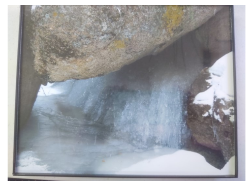
3rd Place - Rose Banzhaf