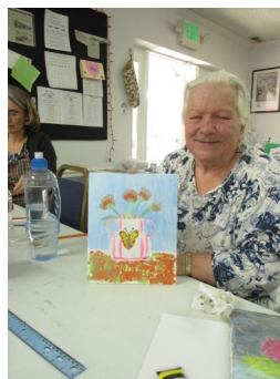
Acrylic Painting Art Class