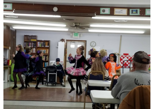
March 15 - Irish Dancers came for lunch entertainment