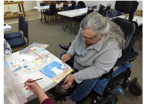
Watercolor Art Class