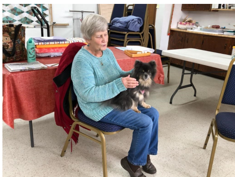
March 18— at the center