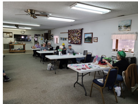
March 11— Saint Patty's Day themed