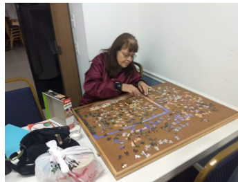
Geri is soooo puzzled!