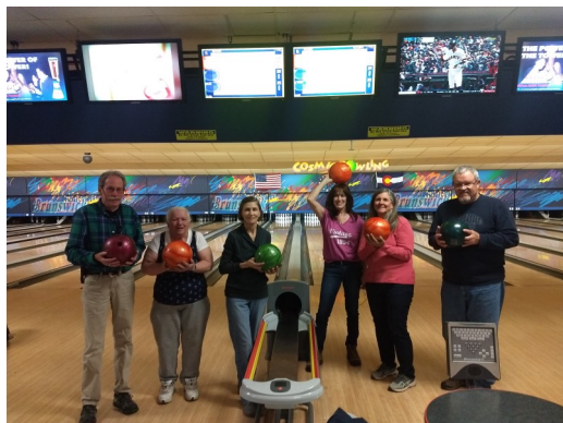
May 23 Bowling