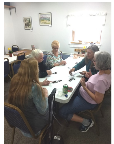
Friday gameday players