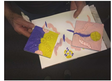
May Collograph Art Classes