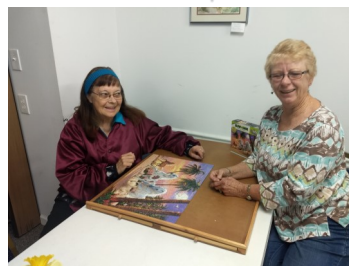
Beverly to the rescue!