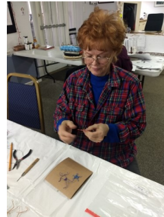
May 29 Exploring Art Class