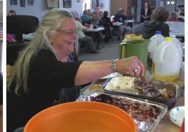
May 28 — Catered Lunch