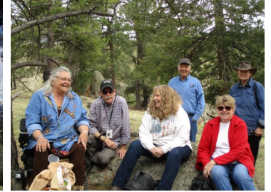
May 26 Mueller Art Show Trip