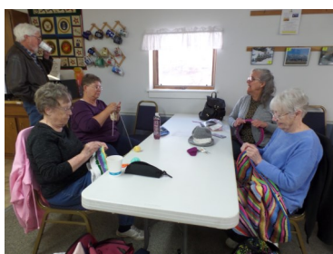
Knitters & Crocheters