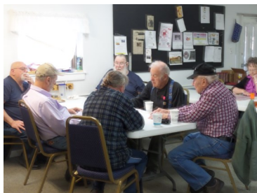
Liar's Table Guys