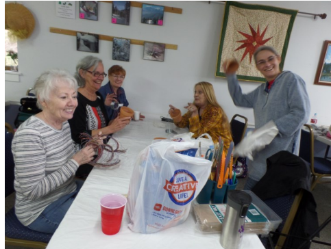
Wire Sculpture Art Class