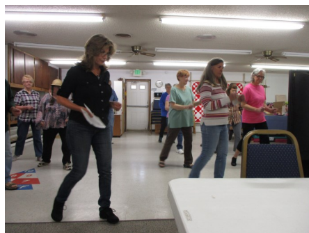
Line Dance Class