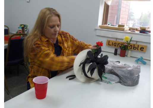
Decorating High Tea Hats