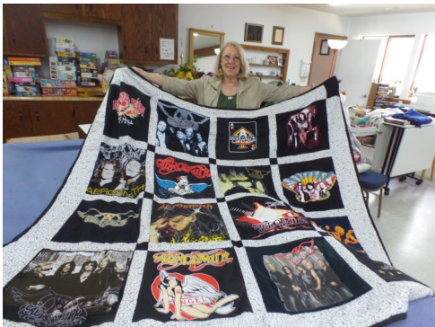
Reversible T-Shirt Quilt