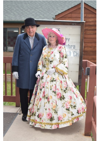
The Harvey Girls kept our teapots and dessert plates full