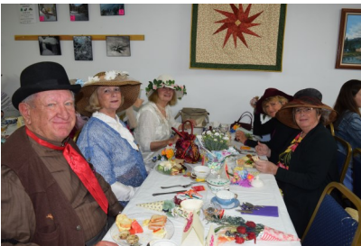
The High AltITooters provided our entertainment