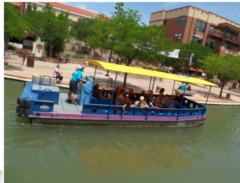
Pueblo Riverwalk Trip