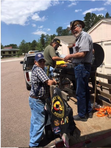
Picnic in the Park July 28, 2018