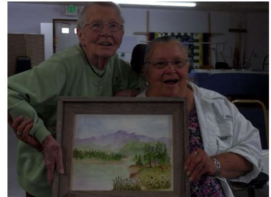
The Morning Guys