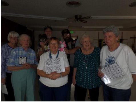
July 5 Bingo