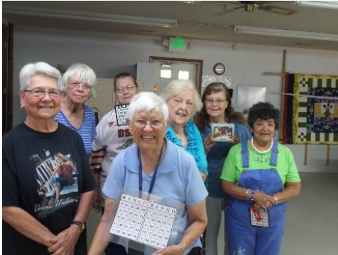
July 12 Bingo