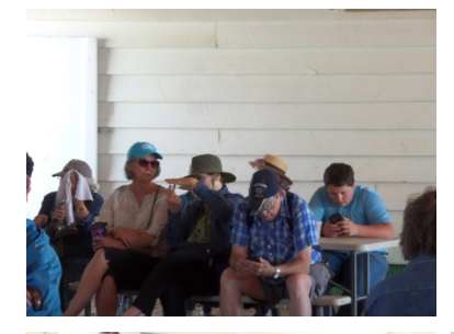
\leftarrow\leftarrow\leftarrow\downarrow\downarrow\downarrow Teller County Fair July 29th \downarrow\downarrow\downarrow\downarrow