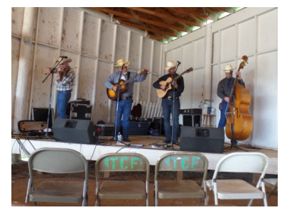
↑↑↑ Flying W Wranglers Free Concert At the Teller County Fair ↑↑↑