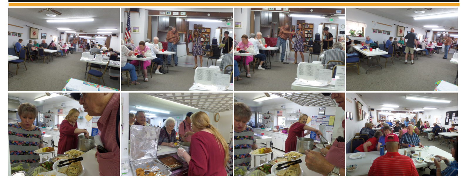
↑↑↑ Catered Meal & Car Fit Presentation ↑↑↑