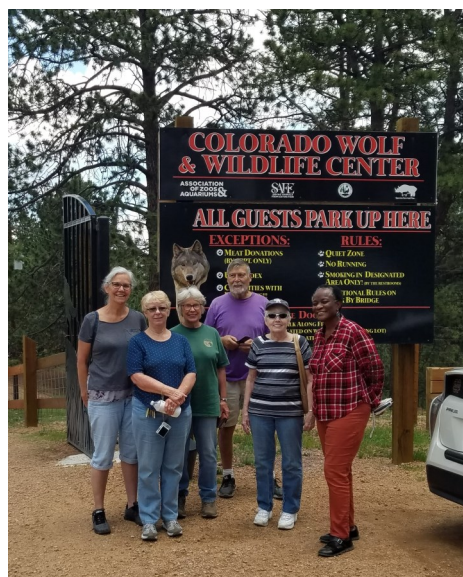
July 23 Wolf Refuge Trip