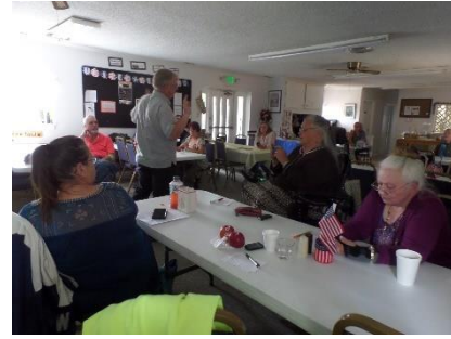
Russ Frisinger Photo Class