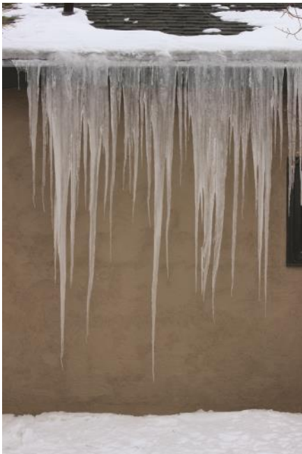
Nearly to the ground.