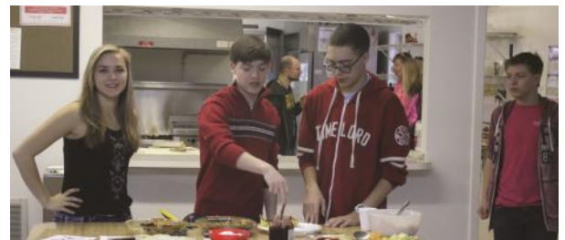
Valentine's Breakfast by Woodland Park High School Key club.