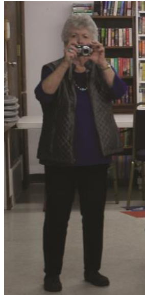
On the wrong end of the camera.