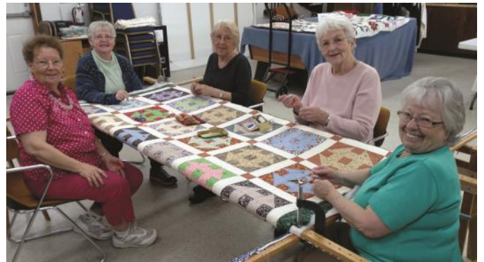
Another beautiful quilt in the works.