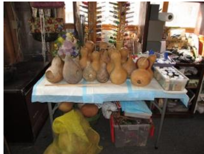
Gourds to Birdhouses.