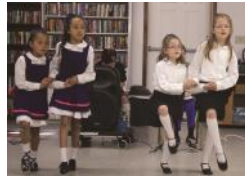
Mountain Eire Irish Dancers.