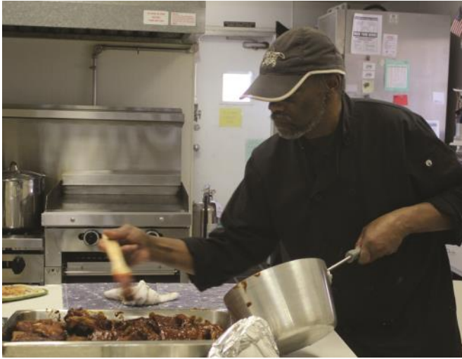
Mmm, mmm ribs!