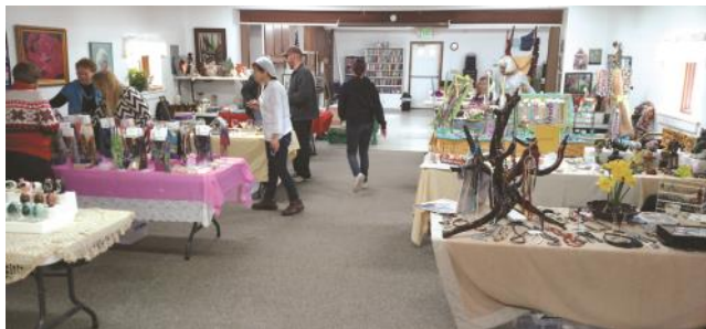
Craft Fair, April 9th, 12 Vendors +Sr Center Tables, $800.