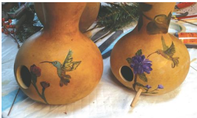
Some of the gourd bird houses and feeders made at Aline's.