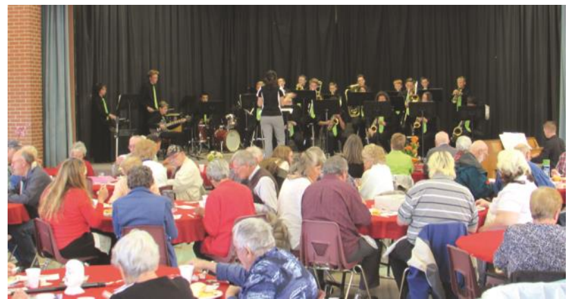
Thank you Woodland Park School District RE2 for a delightful brunch and entertainment.