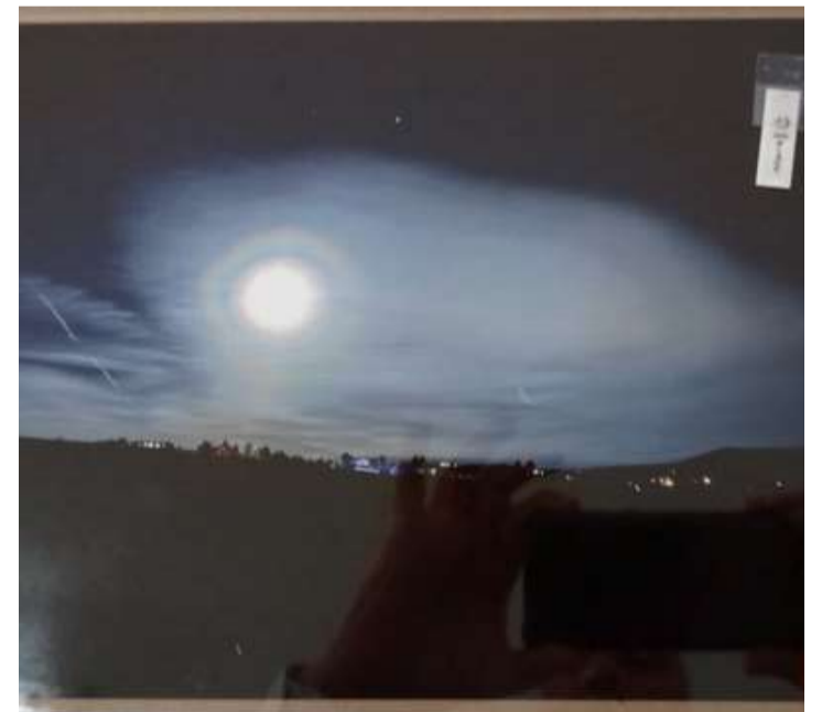
3rd Beth Omenheiser